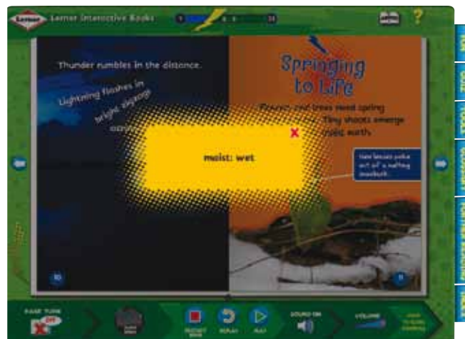
Lerner Interactive Book interactive glossary.

Lesson Idea! Lerner Interactive Books lend themselves perfectly for teaching vocabulary during any size group or individual lesson. Before you introduce a new title identify all content area and challenging words by underlining or highlighting them with the pen and highlighter tools. Using the audio feature, click on each word to model the correct pronunciation to present each new vocabulary word to the class. Tell the class the definition of each word by using the built-in glossary (when applicable). Use each vocabulary word in a sentence to clarify and reinforce its meaning. Then ask students to come up with their own sentences using the new vocabulary words. By taking an active part in figuring out the meaning of the word, students have a better chance of retaining the meaning and growing their vocabulary.